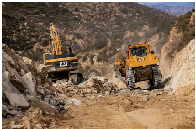
US 60 Pinto Creek Bridge.

We need to maintain our roads to protect our families and the people we care about. Safe and well-maintained roads prevent collisions and ensure that our loved ones can safely get to school, work, church, or other places. They also let us spend less time stuck in traffic and more time with our family.