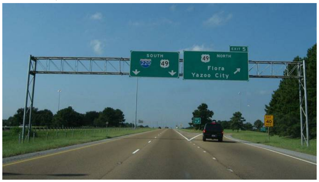
NEW REPORTS SAYS MORE MONEY IS NEEDED TO IMPROVE MISSISSIPPI ROADS.