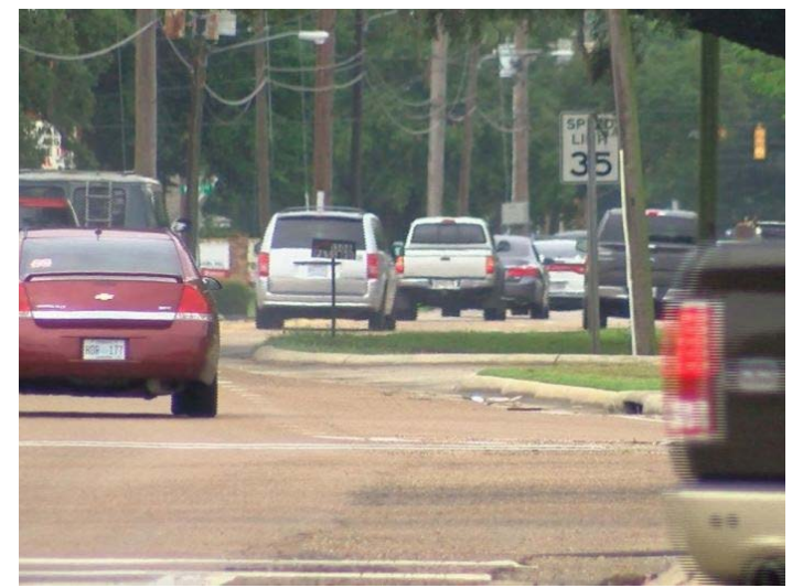
The report suggests roads and bridges that are deteriorated, congested, and lack safety features cost drivers in Mississippi $2.9 billion annually.