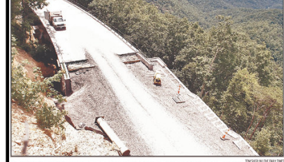
THIS WAS THE SCENE IN 2015 as contractors worked on one of five bridges on the Foothills Parkway between Walden and Weiss Valley.