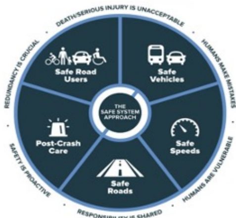
Chart 3. The Safe System Approach

In early 2022 the U.S. Department of Transportation adopted a comprehensive National Roadway Safety Strategy , a roadmap for addressing the nation’s roadway safety crisis based on a Safe System approach that acknowledges the following: humans make mistakes and are physically vulnerable; traffic deaths and serious injuries are unacceptable; traffic deaths and serious injuries need to be reduced by the provision of a redundant transportation system that reduces or minimizes crashes and ensures that, if crashes do occur, they do not result in serious injury or death. [xxv]