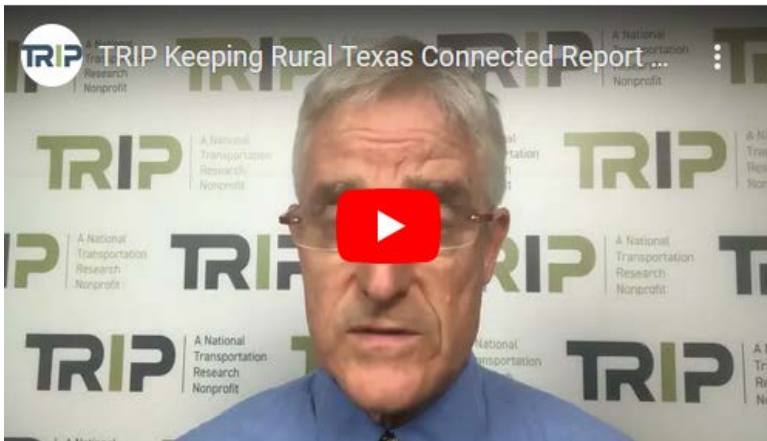
Read the press release from TRIP, a national transportation research:

Increasing traffic levels, a lack of connectivity between urban and rural areas, and a lack of adequate safety features are among the challenges faced on Texas' rural transportation system, according to a new report from TRIP, a national transportation research nonprofit based in Washington, DC. The TRIP report, "Keeping Rural Texas Connected," examines the safety, reliability and connectivity of the state's rural transportation system and evaluates its ability to provide reliable and safe mobility across the state and in several critical corridors.