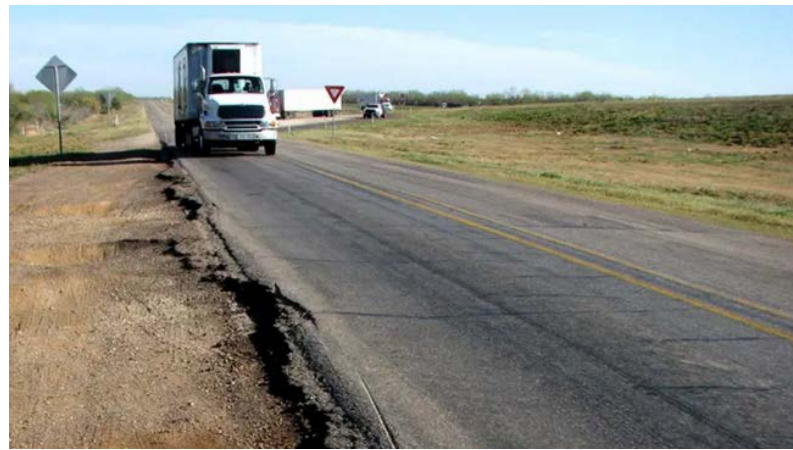
TRIP Report Credit: TXDOT

US 69 / US 175 from Dallas to Beaumont: The modernization of this 239-mile segment will improve the safety and connectivity of the Port of Beaumont, improve economic opportunities for communities along this corridor, and enhance the state's hurricane evacuation routes. The US 69 and US 175 corridor is also part of the future I-14 system. Of the 1,182 miles on the four key rural corridors, TxDOT has completed capacity expansions on 662 miles, has expansion underway on 32 miles, and has funding for expansion to an additional 114 miles. TxDOT estimates that the unfunded backlog to expand the remaining 374 miles – approximately one third of the four key state rural corridors segments in need of widening – is $4.2 billion.