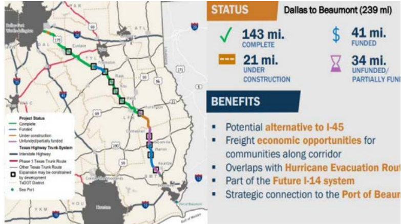
TxDOT. TRIP Report

CLICK HERE to access and read the TRIP report