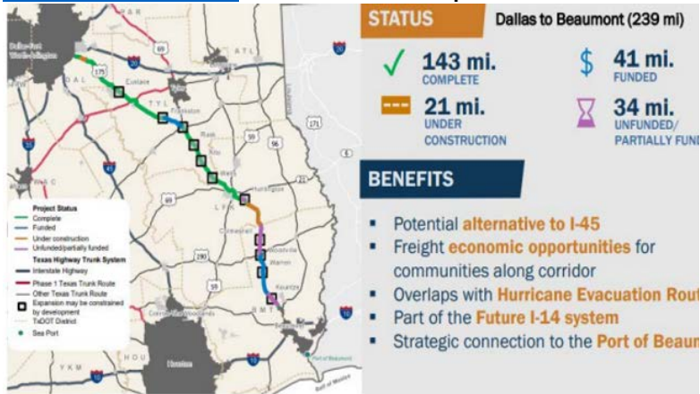
TxDOT. TRIP Report

CLICK HERE to access and read the TRIP report