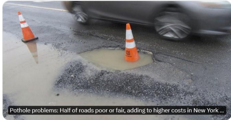
Pothole problems: Half of roads poor or fair, adding to higher costs in New York ...