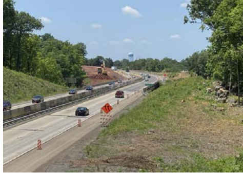
This view from the Park Road bridge shows the Route 422 construction near to the bridge over Sanatoga Creek and Sanatoga Road.

Thankfully, PennDOT is in the process of reconstructing and widening the Route 422 bridge over Sanatoga Creek, built in 1965, although it is causing some traffic headaches currently.