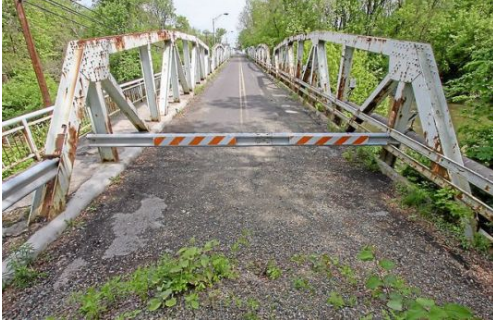
The Keim Street bridge was closed to traffic in 2010 after being found to be structurally unsound. It was recently listed in a report to be among the region's most unsafe bridges.