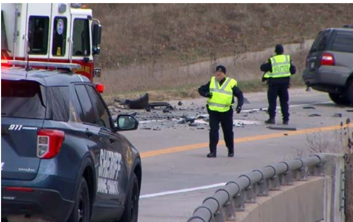
Police work at the scene of a deadly crash on East Broadway in Columbia on Friday, Dec. 2, 2022.