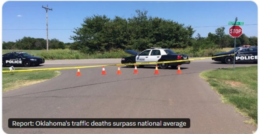
Report: Oklahoma's traffic deaths surpass national average