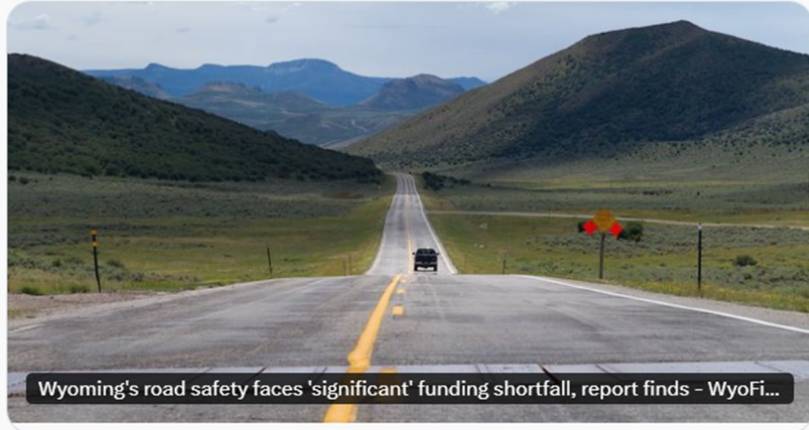
Wyoming's road safety faces 'significant' funding shortfall, report finds - WyoFi...

One-third of state-maintained roads were in poor condition in 2025, the report from a national transportation nonprofit finds, but Wyoming lacks funding to adequately keep up. “We can’t keep putting lipstick on that pig,” WYDOT Director Darin Westby said.