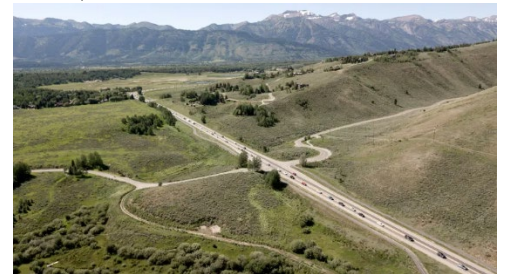
Wyoming Highway 22 connects the town of Jackson to Wilson and climbs Teton Pass, linking the communities of Victor and Driggs, Idaho, to Jackson Hole. A $60 million project would widen a section of the critical commuter artery between Jackson and Wilson.

No. 1 on the list is to reconstruct and redesign the interchange between I-80 and I-25 in Cheyenne, a $500 million project. No. 2 is widening U.S. Highway 287 from Laramie to the Colorado state line, a $59 million project. No. 3 entails improvements along 200 miles of I-80 — including truck climbing zones, variable speed limit zones, truck parking and chain-up areas. It is estimated to cost $270 million.