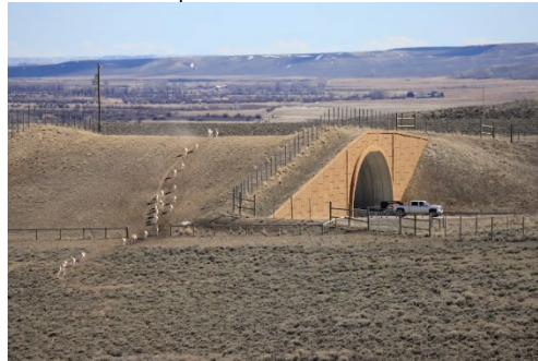
Pronghorn cross a highway near Pinedale, following a route known as the Path of the Pronghorn.

TRIP continually monitors funding conditions across the country, Moretti said, and initiates research projects when it identifies significant funding gaps. That's what led to the latest report.